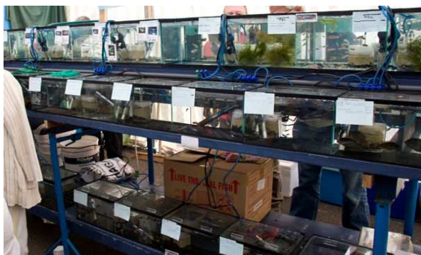
The Club Breeders Sales

Something else that could not be missed - as it was a bit orange - was nicknamed The Tetramini which played the aquarium set up video on the DVD player in the car and displayed in the boot; of course everyone has a TV in the boot of their car.