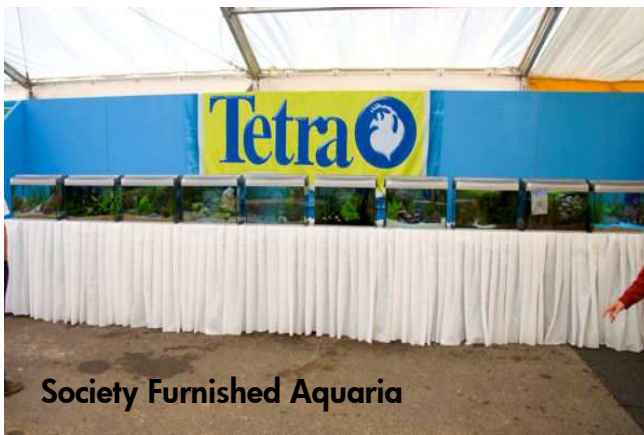
Society Furnished Aquaria

The Furnished Tank Competition was an excellent and striking display again this year with entries from a number of Societies; this also gave Societies the opportunity to advertise their Clubs and activities.